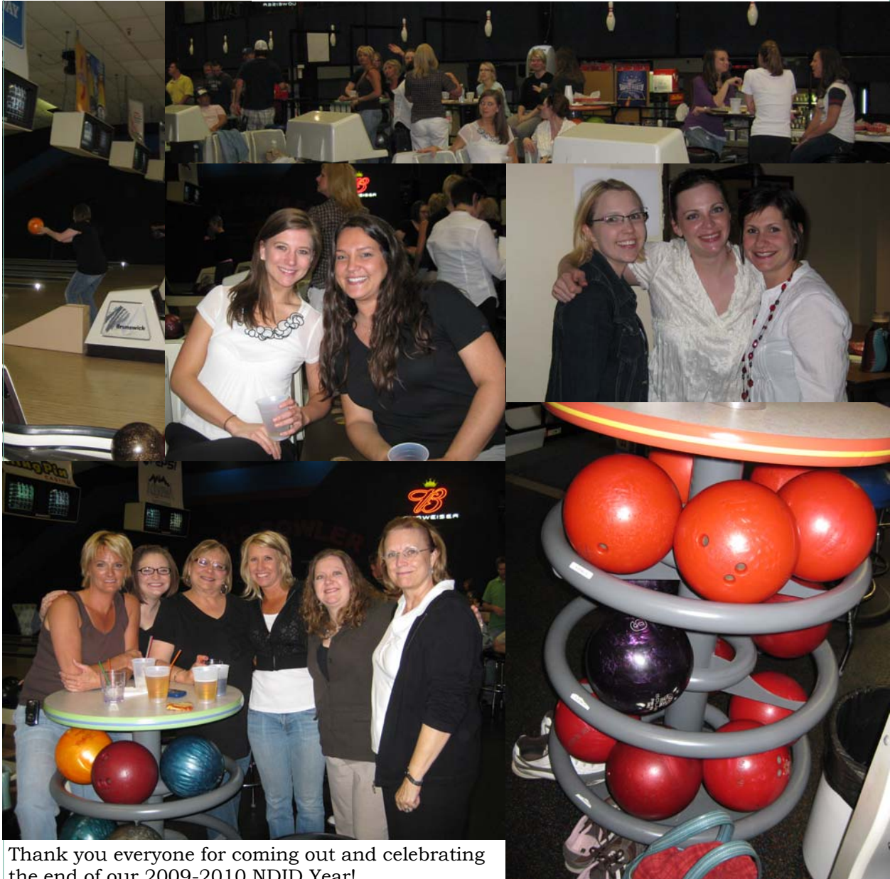
Thank you everyone for coming out and celebrating the end of our 2009-2010 NDID Year!

"The use of the NDID newsletter and its contents is intended for the sole use of NDID members only. Contact newsletter@ndid.org with any questions."