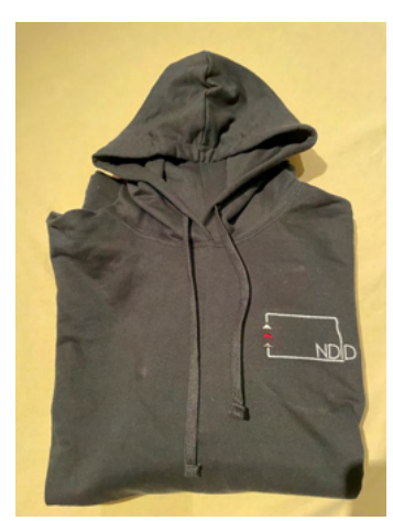
ITEM #3 $35.00/$40.00(2XL) Pullover Hooded Sweatshirt Black with White Logo Sizes: S, M, L, XL, 2XL