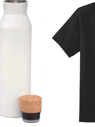
ITEM #1 $25.00 Copper Vac Bottle with Bamboo Cap White with Black Logo