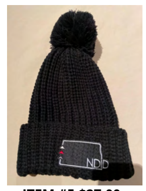
ITEM #5 $27.00 Beanie Black with White Logo