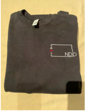
ITEM #4 $45.00/$50.00(2XL) Crewneck Sweatshirt Black with White Logo Sizes: S, M, L, XL, 2XL