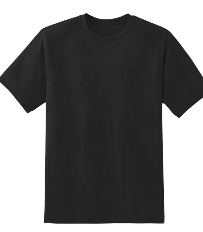
ITEM #2 $25.00 Bella & Canvas Unisex Tshirt Black with White Logo Sizes: S, M, L, XL, 2XL, 3XL